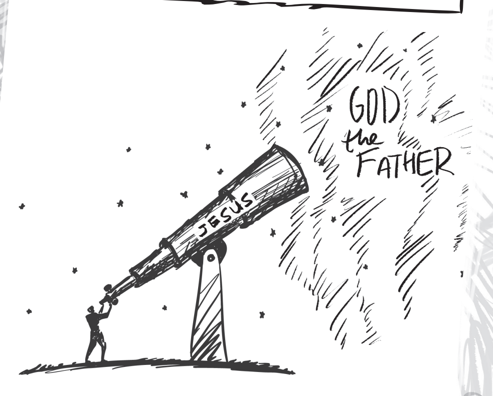
Jesus revealed the Father in everything he did.

If you want to see what God is like, look at Jesus. You can see what God is like in the powerful ways Jesus healed people, defeated demons, and controlled the weather. But as God's Son, Jesus revealed the Father in everything he did. Every kind word, every humble act of service, every moment of patience—all this shows you what our God is truly like in real-life ways we can understand.